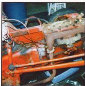
Clean Oil and Grease