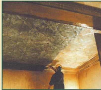
Paint stripping metal ceiling