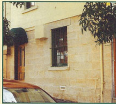
Finished Sandstone Stripping