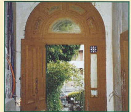
"Heritage No 1" sprayed-on timber door frame.