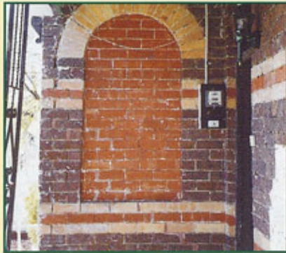
Paint removed & washed Veranda brick work