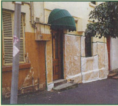
Cover-up during paint removal.