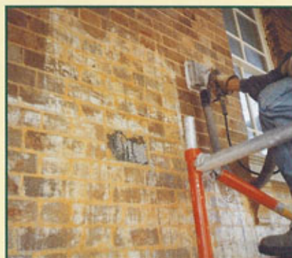
Washing & rinsing with turbo tool.