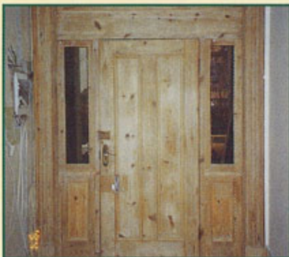
Finished timber stripping